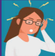
Muscle or bodyaches